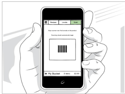
Items scanned will be placed in his basket. The total of the basket is displayed so that he can keep track of his spending