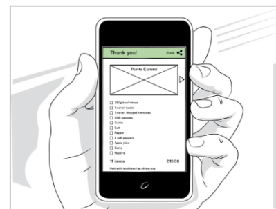
The final receipt is displayed with all of the items. At the top it highlights amount of loyalty points earned.