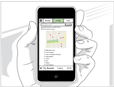
By using the locate feature for items listed in the recipe to help make his experience in shop more efficient