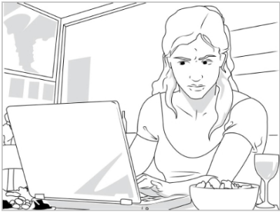
It's 5pm and Olivia just realized that she has to stay late at work for a deadline tomorrow