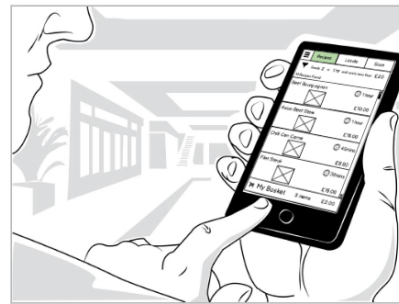
Using the "Recipe" guide he is able to compare different recipes based on cost and time it takes to make it